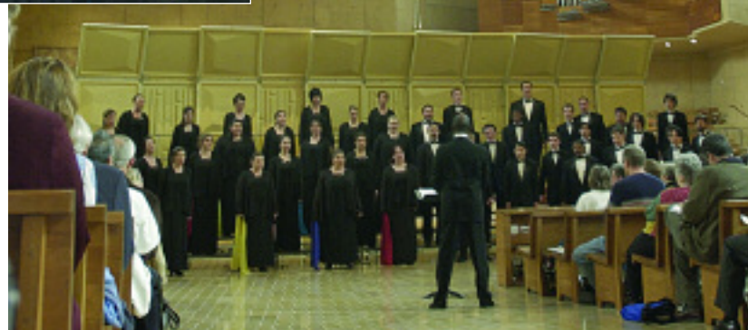
Invited for a repeat performance at the American Choral Directors Association convention, the university’s Northridge Singers drew standing ovations during a February 4 afternoon concert at the Cathedral of Our Lady of the Angels in downtown Los Angeles.