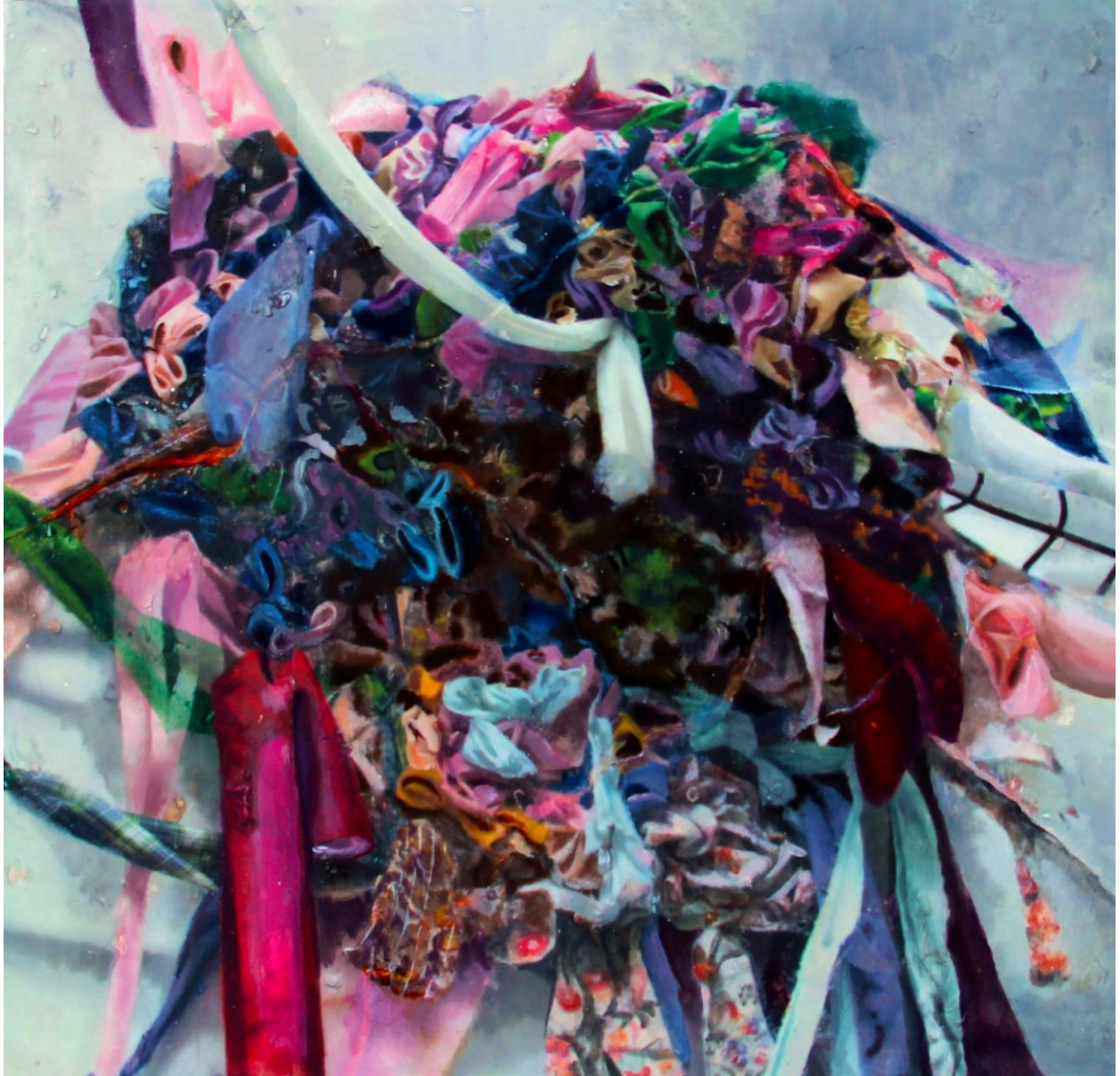
Figure 5 Aunt Sara No.1 , 2014 Oil, mixed media on gessoed rag, 18 x 18 inches