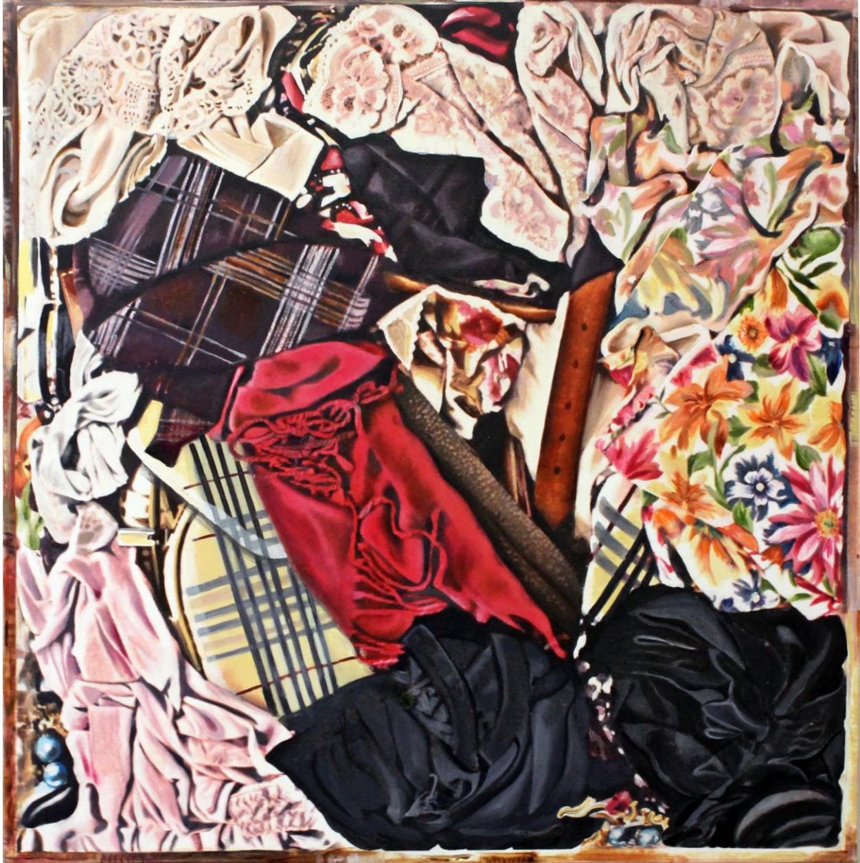
Figure 10 Compressed Happiness No.8 , 2015 Oil, mixed media on canvas, 24 x 24 inches