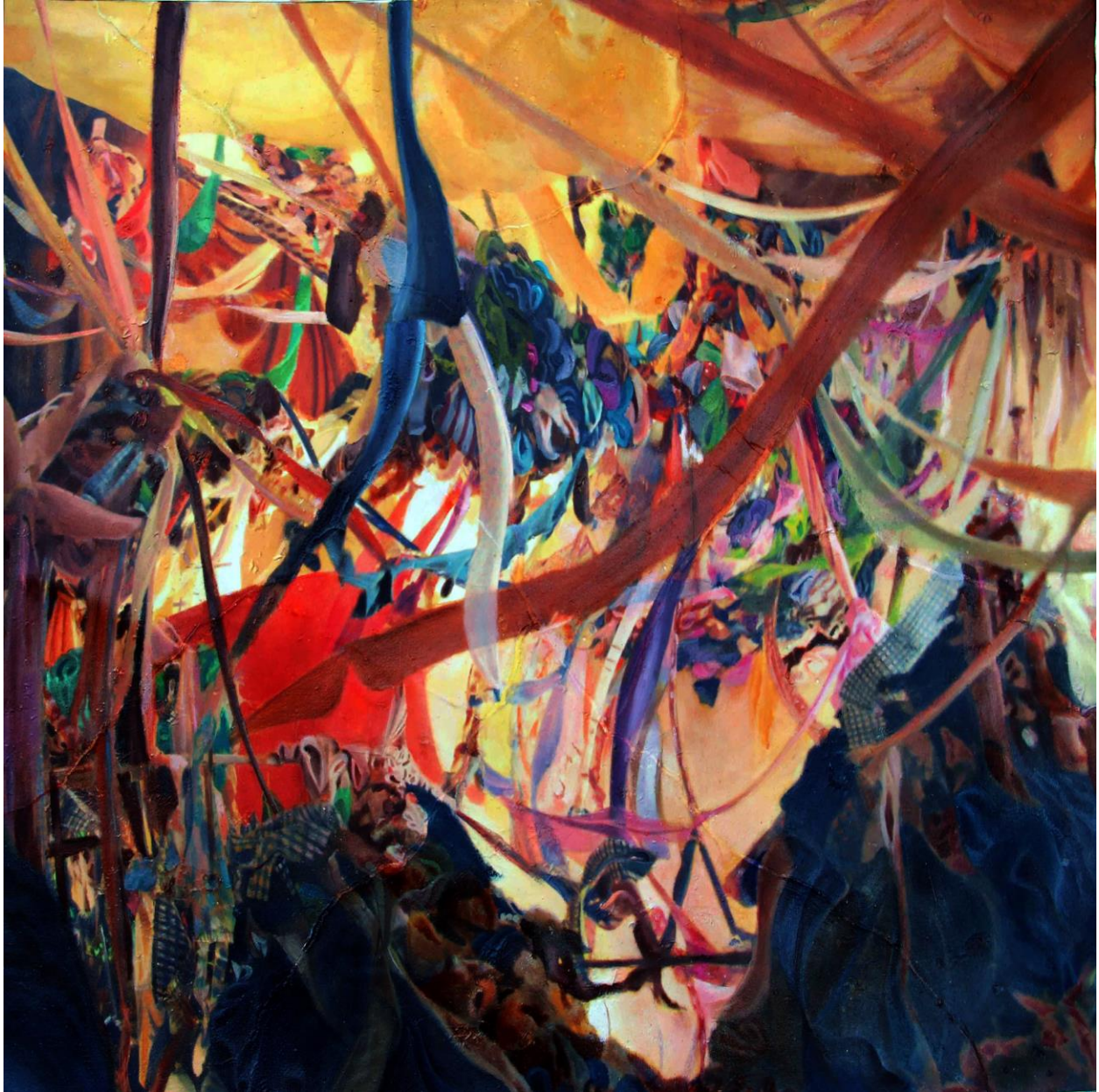
Figure 2 Eye of the Hurricane Series No.18, 2015 Oil, mixed media on canvas, 48 x 48 inches