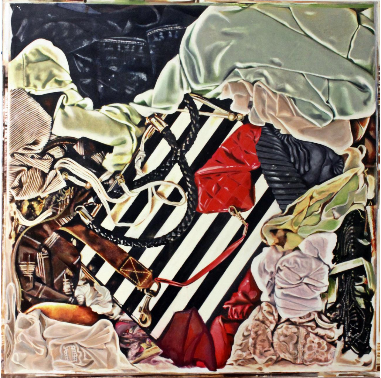
Figure 9 Compressed Happiness No.7, 2015 Oil, mixed media on canvas, 24 x 24 inches