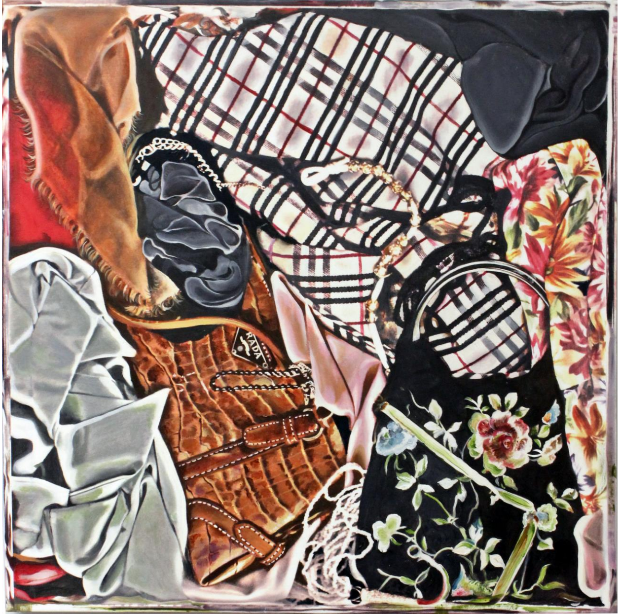
Figure 11 Compressed Happiness No.9 , 2015 Oil, mixed media on canvas, 24 x 24 inches