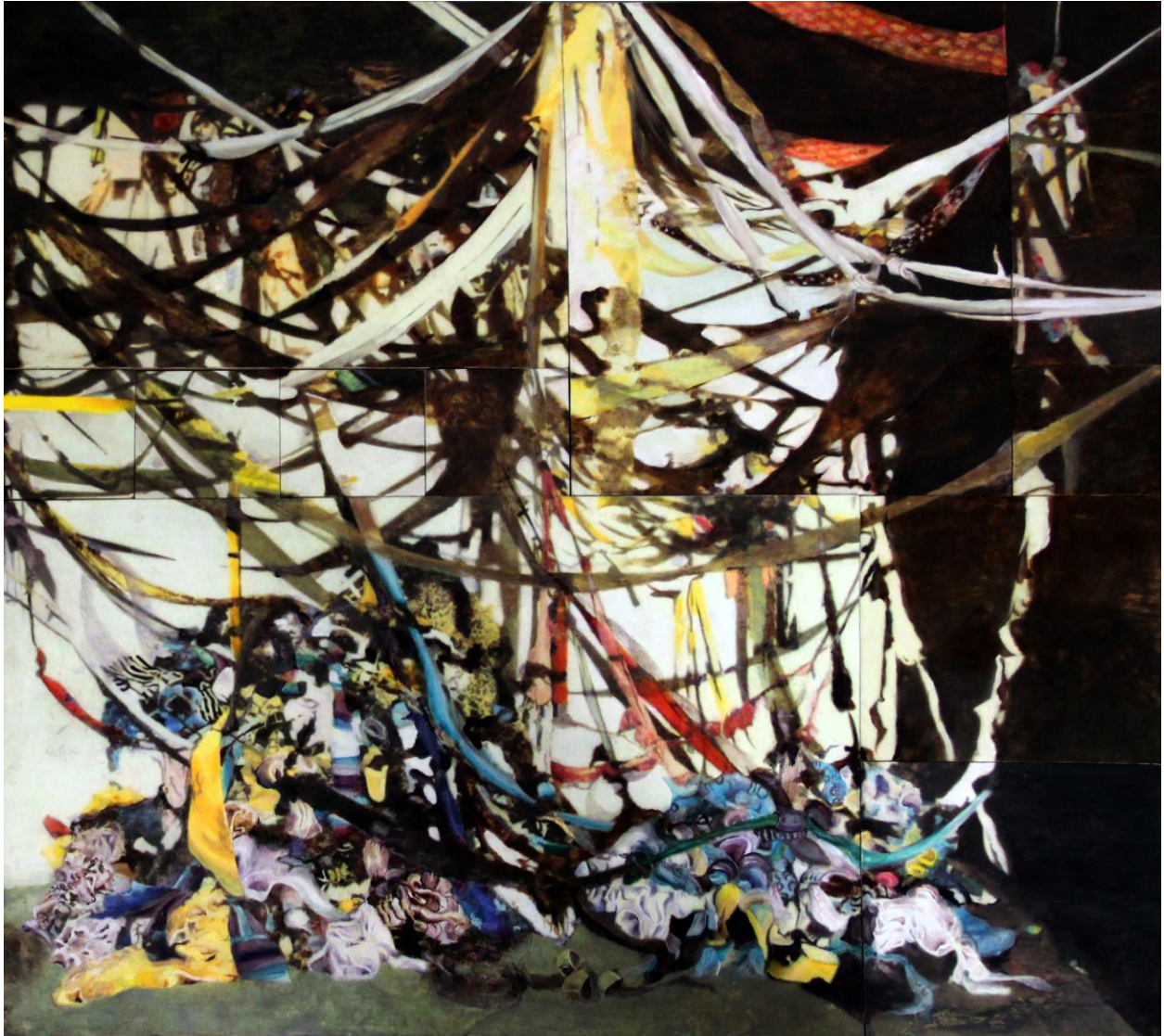
Figure 3 ...we all fall down, 2014 Oil, mixed media on birch wood panels, 48 x 48 inches