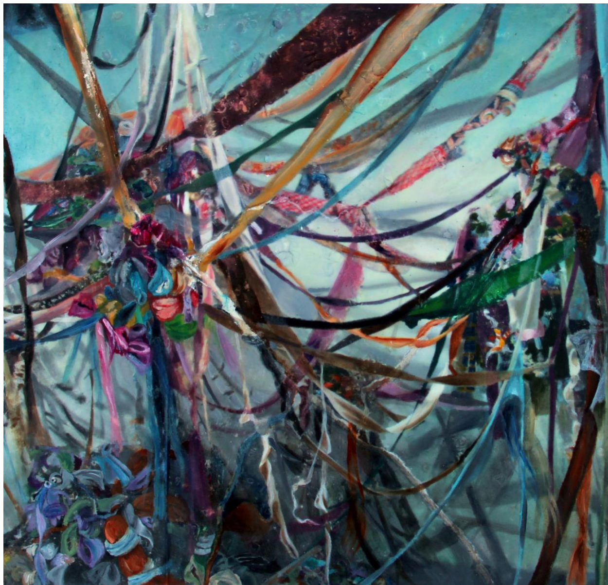
Figure 1 Neuron Breakdown , 2014 Oil, mixed media on maple wood panel, 48 x 48 inches