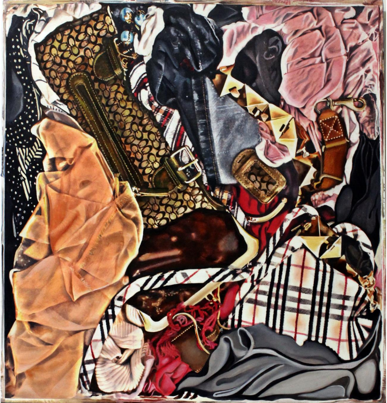
Figure 12 Compressed Happiness No.10 , 2015 Oil, mixed media on canvas, 24 x 24 inches