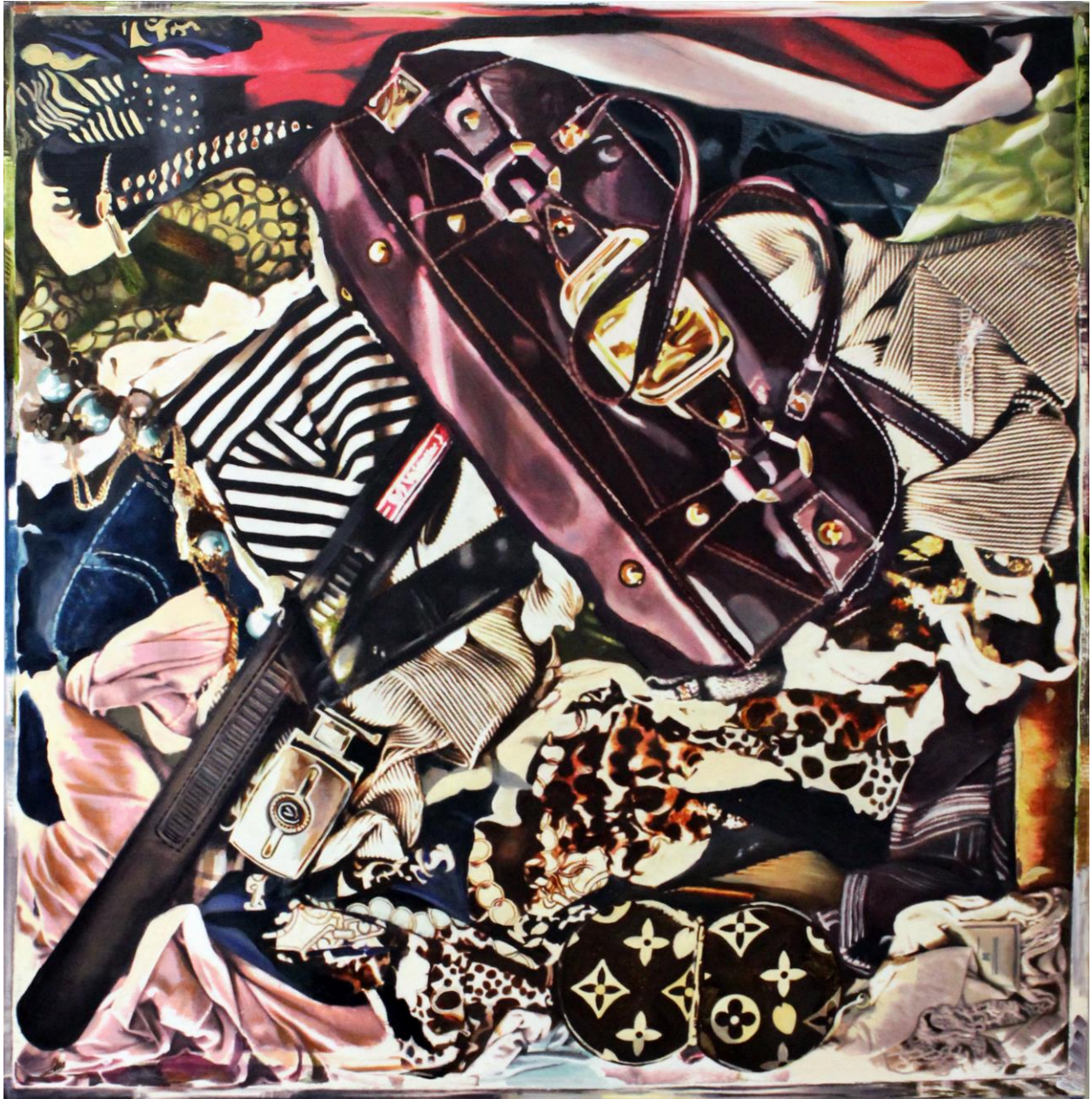
Figure 8 Compressed Happiness No.6 , 2015 Oil, mixed media on canvas, 24 x 24 inches