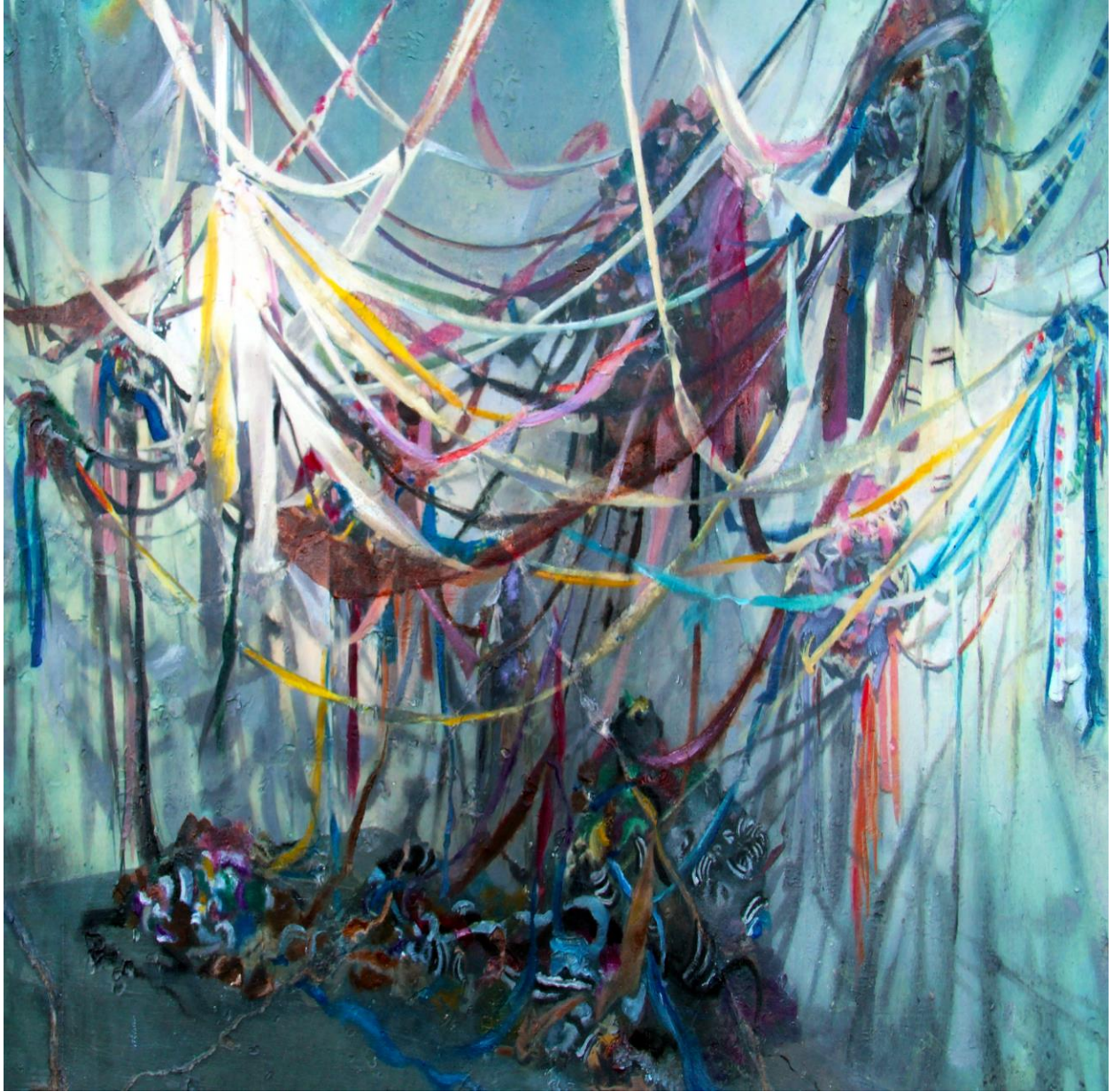
Figure 1-1 ...but I wanted it! 2014 Oil, mixed media on gessoed rag, 20.5 x 28.5 inches