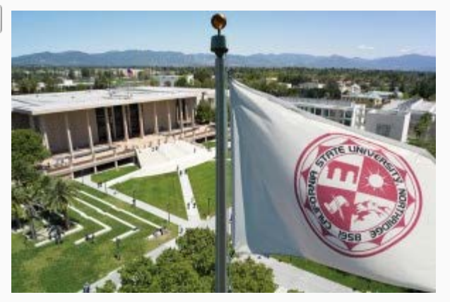
The accredited CSUN campus.

The Western Association of Schools and Colleges noted recently during its reaccreditation process that CSUN was "a model learning organization." We couldn't agree more.