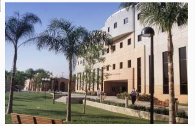
The CSUN campus.

Most graduate students aim to one day take what they learn in the classroom and apply it in the real world. This year, CSUN MBA students took the next step in preparing for that world by capturing top honors in a national competition hosted by the Small Business Institute.