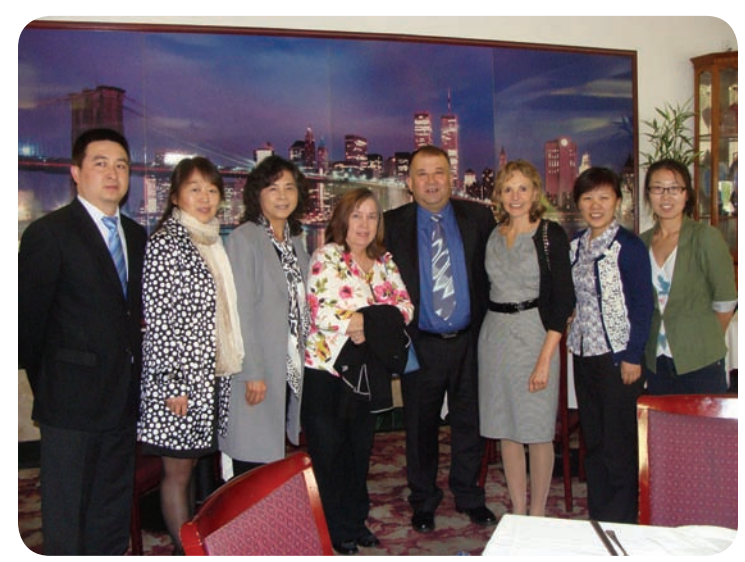
Xinjiang delegation with CSUN education faculty