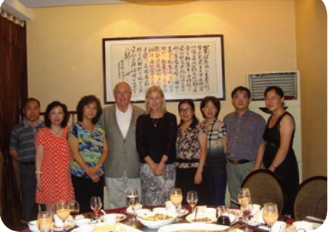
Suzhou - with Soochow University faculty