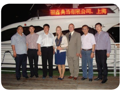
Meeting Shanghai Gavernment Scholars, Business Entrepreneurs & CSUN Alumni