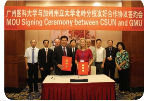
MOU Renewal at Guangzhou Medical University