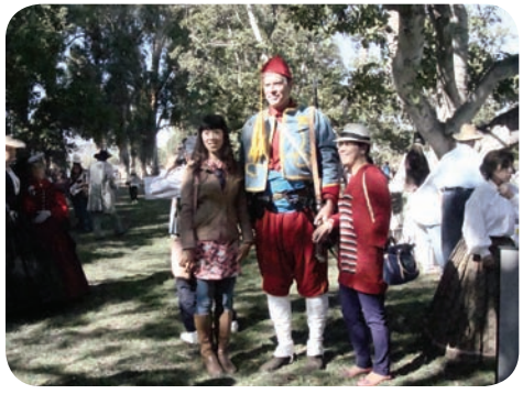
Scholars Learn and Have Fun at the "Civil War Reenactment"