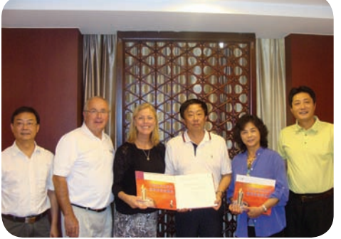
Suzhou Sports Commission