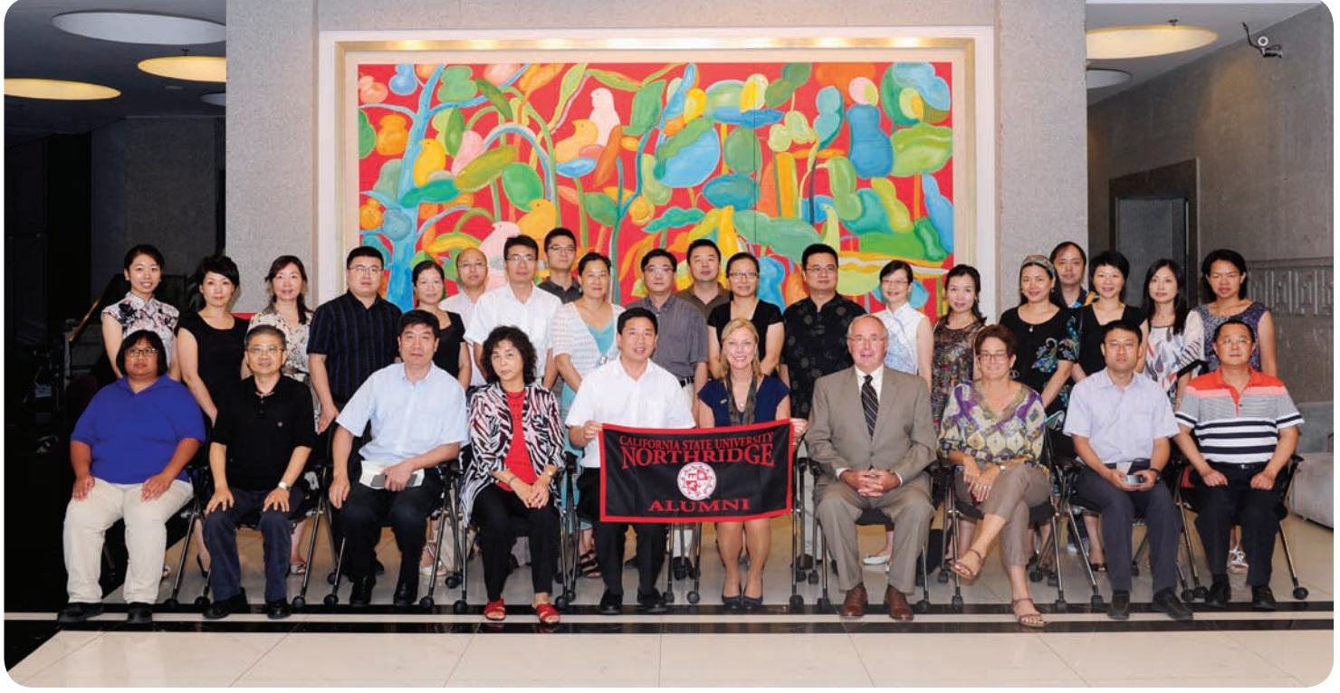
Shanghai Tea Reception for CSUN Alumni