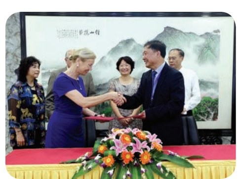
MOU Renewal at Nanjing University of Science and Technology