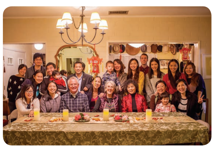
Chinese New Year party at the Kolstads