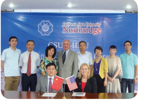
Nanjing Hohai University - MOU Signing Ceremony with CSUN Alumni