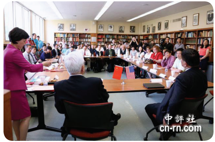
China Forum - Great Audience!