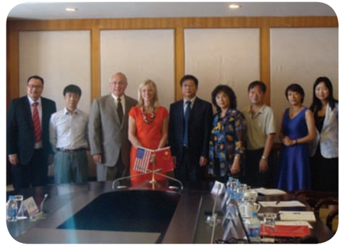
East China Normal University