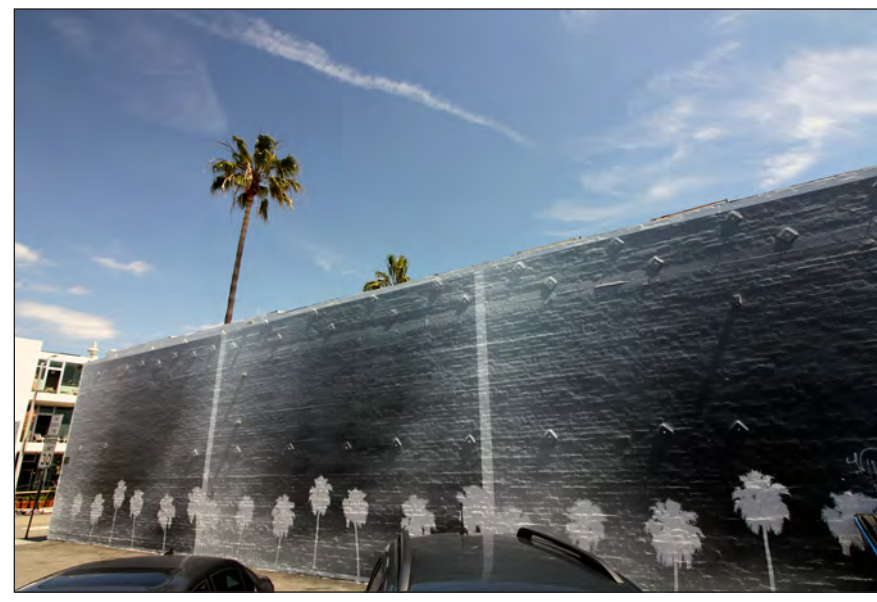
Figure 18.—Urban Context. A photorealistic depiction of palm trees, this is the second of two similar pieces in the same space since 2016. Daily Palm, Noah Abrams, 2018.

context: Noah Abrams's photorealistic mural of palm trees, when viewed at a certain angle, includes an actual palm tree on the adjacent street (Figure 18). This reflects how, as noted by Burham (2010), public art can work in tandem with the city.