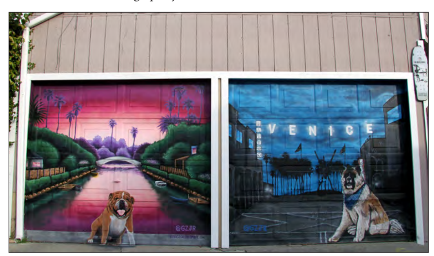
Figure 4.—Place-Based: Local Landmarks. This art, on garage doors in a residential neighborhood, is as much a tribute to the dogs as it is to the Venice canals (left door) and the Venice sign (right door). Title unknown, Gustavo Zermeño, Jr., 2016 and 2018.