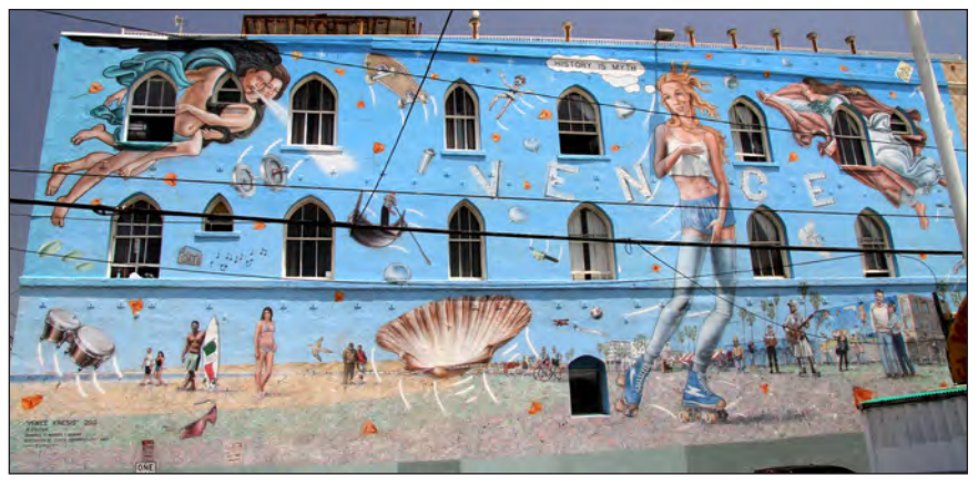
Figure 2.—Place-Based: Local Landmarks. This adaptation of Botticelli's The Birth of Venus features Venice landmarks, including the Venice sign, the boardwalk, the Ballerina Clown sculpture, and references to weightlifting, surfing, the drum circle, skating, music, performance artists, and more. Venice Kinesis, Rip Cronk, 2010.

Representations of local landmarks and scenes are quite visible, and include scenes of Venice's canals, signs, and buildings. Local environments are seen in art that depicts palm trees, beaches, and ocean scenes. Local history and people are seen in images from Venice's past, including images of Venice founder Abbot Kinney, people connected with Venice (described in further detail below), as well as more recent events, such as the filming of specific movies. Examples of scenes from Venice, Italy, are infrequent, but include Venetian canals, bridges, and masks. Some public art makes textual connections to place through the inclusion of toponyms (e.g., "Venice," "Muscle Beach"). In several subtle cases, an image obliquely connects to a place (such as images of roses on Rose Avenue). As the use of local elements anchors art to the local context, public art in Venice creates a distinctive sense of place. The integration of local elements in public art has been described in other contexts, such as Arreola's analysis of Mexican-American murals (1984). However, Venice is unique in that local or place-based elements are present in a relatively large percentage of public art. Examples of public artwork that features this first category of elements are shown in Figures 2, 3, and 4.