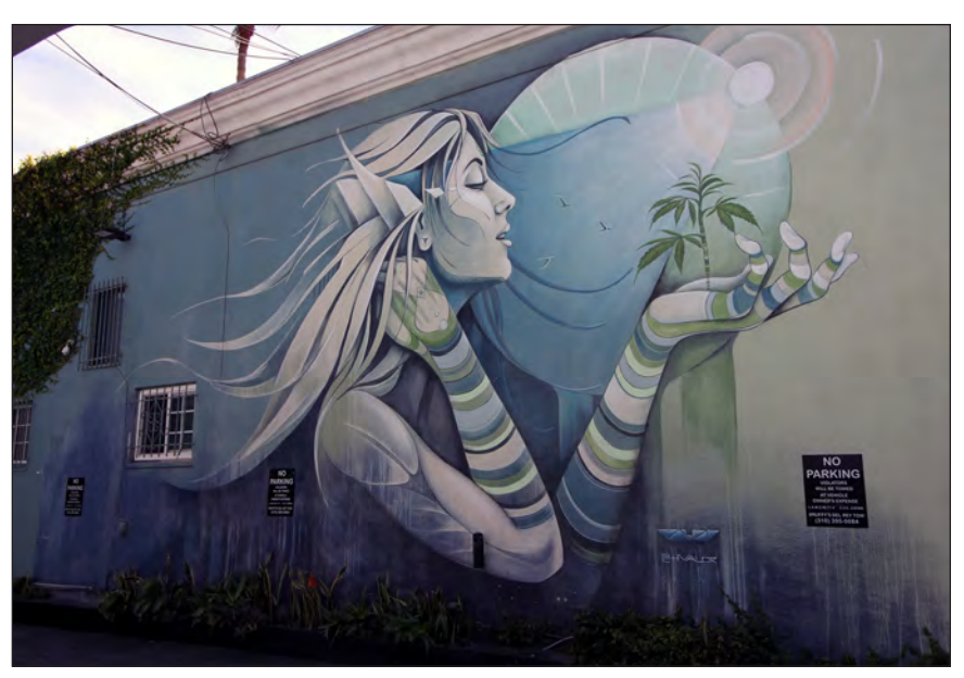
Figure 14.—Commercial. This artwork by artist Hans Walor appears on the side of a marijuana dispensary. Green Goddess, Hans Walor, 2015.