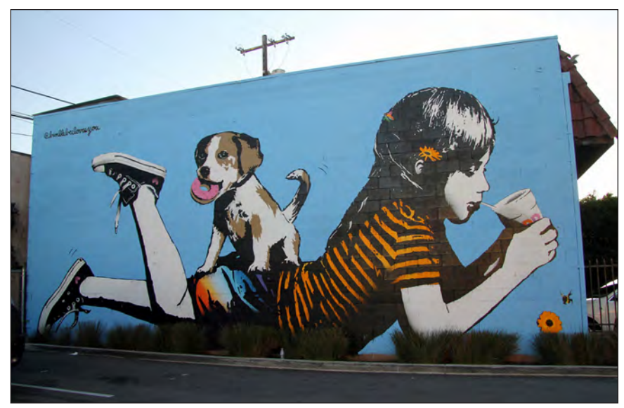
Figure 13.—Commercial. Artwork by BumblebeeLovesYou combines the artist's signature series about childhood with subtle references to the Dunkin Donuts business whose parking lot it adorns. Dunkin Donuts, BumblebeeLovesYou, 2015.