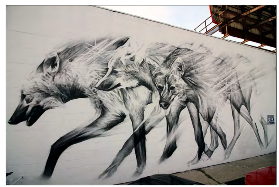
Figure 9.—Nature: Animals and Insects. This mural of three maned wolves was created in conjunction with Carbon, an art exhibit by Canadian-born, Brooklyn-based artist Li Hill. The exhibit depicts monochromatic portraits of animals whose habitats are affected by climate change. Maned Wolves, Li Hill, 2015.