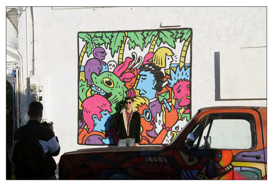
Figure 22.—Multiple Publics. Taking photographs with public art.