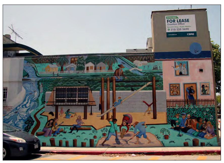
Figure 15.—Temporality. This is a portion of a larger mural that depicts bulldozers and machinery tearing down a home with someone in it, migratory birds, and community scenes in the Venice canals (top). The individuals depicted in the mural were actual residents at the time of painting. This mural has been painted out and restored several times. Note that the sign in the upper right indicates that the property was available for a "creative office" lease at the time that the photograph was taken, a reflection of the continued importance of the creative economy. A discussion of this mural in Davidson (2007) illustrates the author's arguments about civic protests of modernist development in Los Angeles. The People of Venice vs. the Developers, Emily Winters, 1975.

My review of two mural surveys conducted in the Venice area by Dunitz in 1993 and 1998 indicates that fourteen of the forty murals documented in 1993 were no longer present five years later—a loss of about thirty-five percent. In comparison, two new murals were created in Venice in the same time period.<sup>7</sup> Of twenty-five exterior murals documented by Dunitz in 1998, six (almost twenty-four percent) were no longer present in 2019. In some cases, the buildings or walls themselves have been destroyed, while the murals have been painted over in others. Public art's ephemerality is noteworthy, even if not unique to Venice.<sup>8</sup>