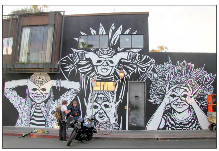
Figure 8.—People. This mural, just off of Abbott Kinney Boulevard, is by Israeli artist Pilpeled. Title unknown, Pilpeled, 2019.