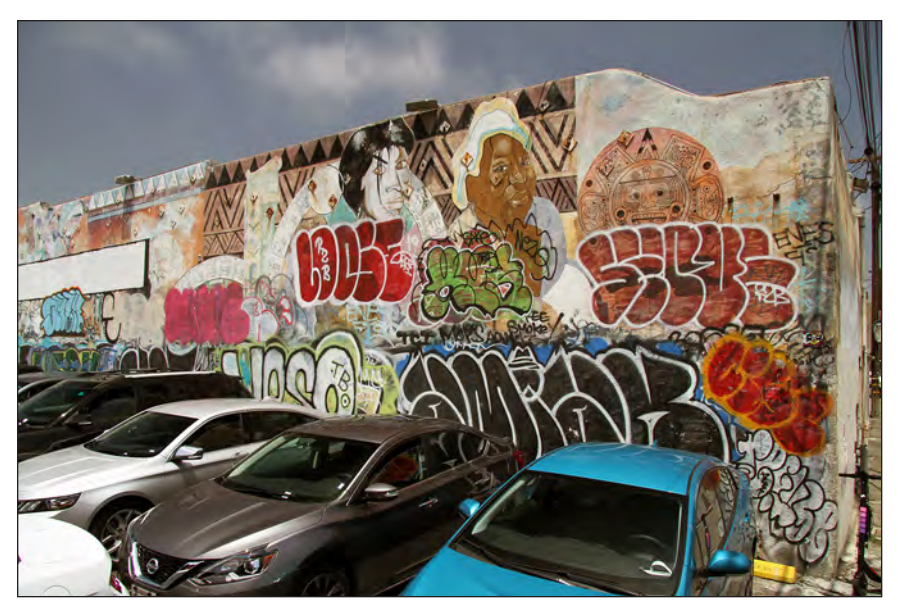
Figure 21.—Ephemerality. Damaged mural, artist and date unknown.

The observations made in Venice indicate many ways in which public art marks the cultural landscape and creates a specific sense of place. But it is too simplistic to argue that public art always beautifies the landscape, always creates a sense of place, and always expresses and shapes identity. While I agree that public art can create representational space (Lefebvre 1991), I maintain that a broader perspective is needed, one that critically assesses what and where public art contributes to the cultural landscape, what identities it expresses and how, who it serves and how, and how and