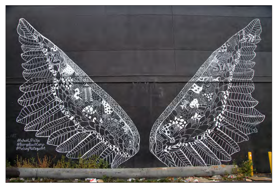
Figure 23.—Multiple Publics. These wings cover almost the entire height of a two-story building. They are part of a larger series of wings that artist Kelsey Montague has been creating since 2014, which are designed for viewers to interact with. What Lifts You, Kelsey Montague, 2017.

public art just outside the study area boundaries.<sup>11</sup> Furthermore, it was necessary to delimit the study subject. There are many forms of public art in Venice, but not all of them could be included in this study. Thus, in this project I examine painted art on a wall but exclude painted art on a utility box adjacent to that wall. Similarly, some public art (e.g., graffiti or aerosol art) blurs boundaries and cannot be easily categorized. A small number of graffiti works were included in this inventory of public art if they depicted a specific, non-textual object (e.g., an image of a person); graffiti that did not meet this criteria was not. Thus, while the density of public art in Venice is high compared to other parts of Los Angeles, parts of Venice's public art ecosystem are not addressed in this study.