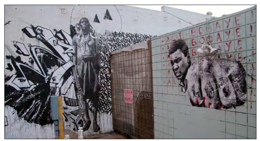
Figure 6.—People. The artwork on the left is the product of a collaboration between New York-based Bisco Smith and South African-born Ralph Ziman (Africa_47). This is one portion of a (partially inaccessible) larger wall. Worlds Collide, Bisco Smith and Ralph Ziman, 2015. The artwork on the right is by Ralph Ziman, who now lives in Los Angeles and maintains a studio in Venice. The Greatest (Ali Boomaye), Ralph Ziman, 2016.