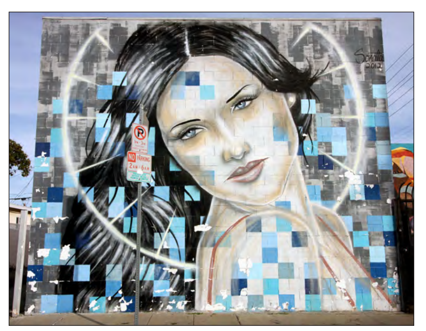
Figure 5.—This artwork graces an automotive repair shop on Lincoln Blvd. Title unknown, Sonata, 2012.

The second-most common category of elements in public art in Venice is that of people, with just over twenty-seven percent of public artworks (ninety-six artworks) including an image from one of three "people"-related subcategories: individuals, prominent people, and human figures. The largest subtheme is that of individuals, in depictions of real and imagined people that range from serious to whimsical. The second-largest subtheme is that of celebrities and prominent people associated with Venice. These include links with local history (including figures such as Abbot Kinney and images of people at the amusement parks in the 1920s) as well as modern celebrities with connections to Venice. Examples of the latter include Arnold Schwarzenegger, the Red Hot Chili Peppers (in a mural on the building on which they conducted a rooftop concert in 2011), Jim Morrison of The Doors, Teena Marie, Dennis Hopper, and Ronda Rousey (all of whom lived in Venice). On Windward Avenue, a small mural of Wesley Snipes and Woody Harrelson recalls their collaboration in White Men Can't Jump (1992); this mural is diagonally across from an expansive four-story mural that depicts Charlton Heston and Janet Leigh in the opening scene from Orson Welles' Touch of Evil (1958). Both films were shot in Venice. Finally, a smaller subtheme is that of human figures, typically in more abstract forms. Examples of public artwork that features this category of elements are presented in Figures 5, 6, 7, and 8.