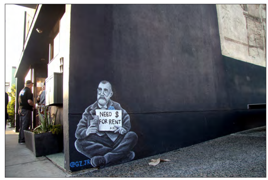
Figure 19.—Social Issues. This image of Abbott Kinney panhandling, on the street that is named after him, in the place that he founded, comments on the recent changes that Venice has experienced. Title unknown, Gustavo Zermeño, Jr., 2018.

of a Native American figure includes the quote: "When the last tree is cut down, the last fish eaten, and the last stream poisoned, you will realize that you cannot eat money" (Figures 19 and 20). While these artists are staking a claim to the city and addressing provocative urban questions (Pinder 2008; Harvey 2012, 315) in ways that are striking, given the conspicuous consumption and boutique stores that surround their artworks, these messages are exceptions on Abbot Kinney Boulevard. Thus, a consideration of the spatiothematic dimensions of public art, in a way that includes the local social and historical context, can highlight public art's functions by analyzing what the larger body of public art does , but also what it does not do.