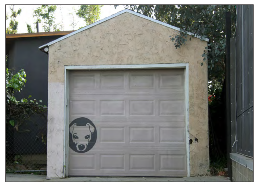
Figure 17.—Scale/Visibility. This small image (2.5 feet tall, 2 feet wide) of a dog observes a busy street in a residential neighborhood. Title, artist, and date unknown.

context: Noah Abrams's photorealistic mural of palm trees, when viewed at a certain angle, includes an actual palm tree on the adjacent street (Figure 18). This reflects how, as noted by Burham (2010), public art can work in tandem with the city.