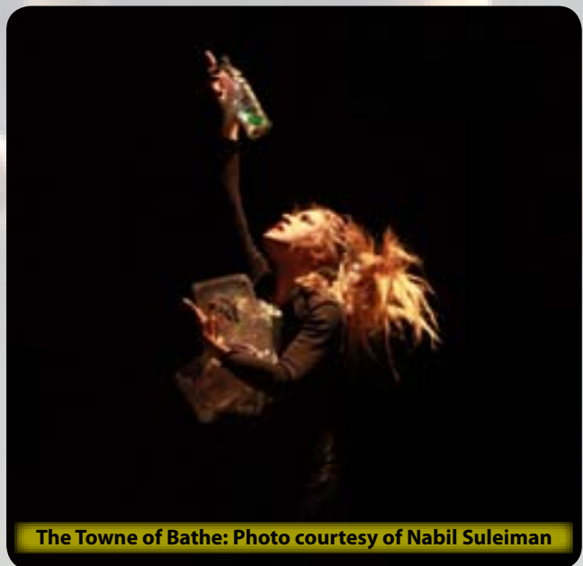
The Towne of Bathe