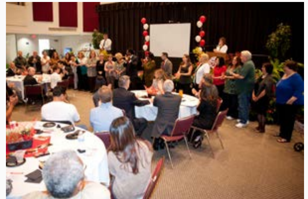
Looking back: California State University, Northridge staff celebrate their colleagues at last year's Staff Service Awards and Recognition of Excellence Event.