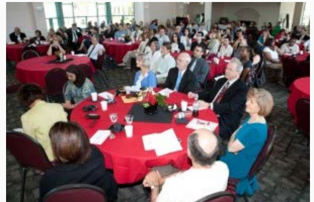
California State University, Northridge faculty celebrate their colleagues at last year's Honored Faculty Reception.