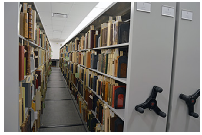
The stacks, inside of the newly renovated Special Collections and Archives.

After much collaboration, planning, and noisy late-night construction the Oviatt Library's second floor has been transformed. Special Collections & Archives is a beautiful new space where students and researchers discover the many wonderful rare items that Special Collections & Archives houses. Before its extensive modernization, the Reading Room was tucked far away in the southwest corner of the Library Exhibit Gallery, and collections were stored in rooms all over the Library. In the new space the Reading Room, modern compact shelving, and staff work areas are now all in the same area, making it easier for