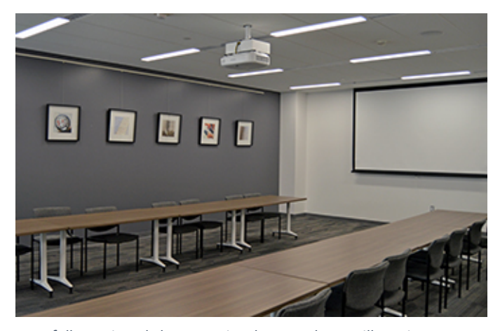
New fully-equipped classroom in where students will receive instruction in how to use primary and archival sources in their research.

For additional information about the Special Collections & Archives Opening, or to learn more about all Library events, please <u>visit Exhibitions and Events</u> or call (818) 677-2638.