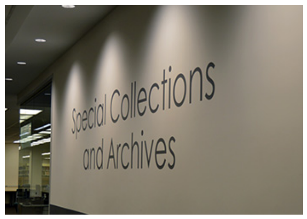
Outside of Special Collections and Archives.

Special Collections and Archives houses 50,000 cataloged items, including rare books, art, manuscripts and archives, historical and important periodicals, photographs, audio and video recordings prints, and maps. Many of these rare and valuable materials are housed in the department's new temperature and humidity-controlled high-density storage facility. Thanks to the generous gift by The Jack and Florence Ferman Trust the Oviatt Library will grow its collection, and will continue to maintain and preserve the resources it holds.